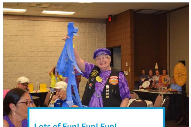
Lots of Fun! Fun! Fun!