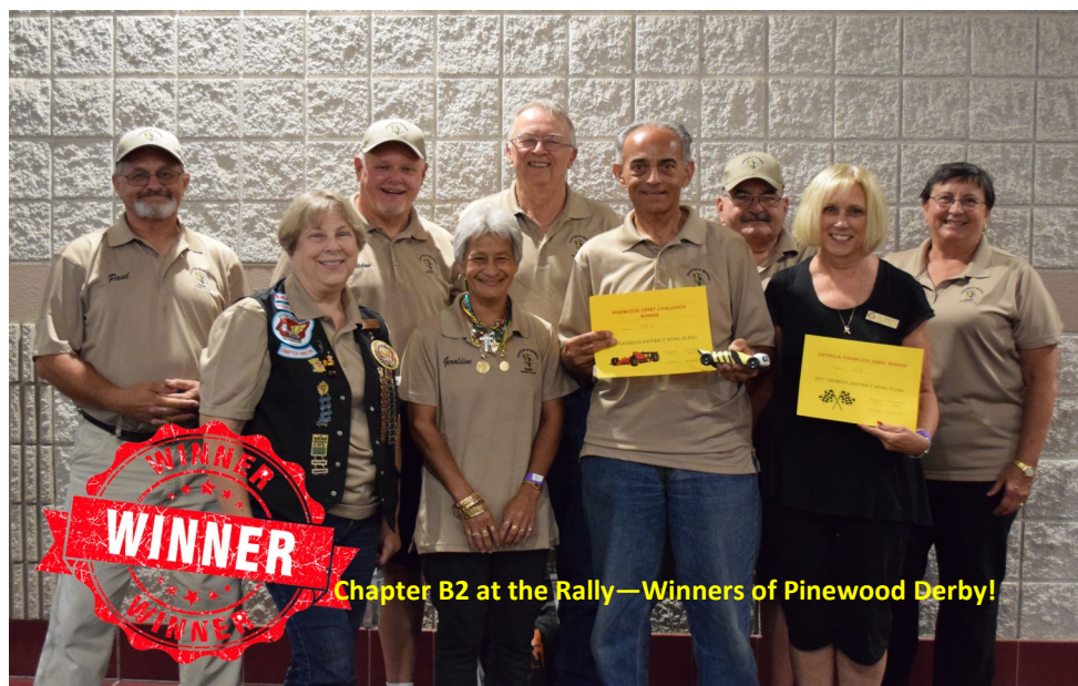
Chapter B2 at the Rally—Winners of Pinewood Derby!

Chapter B's car won the Georgia race! The second race was between the Out-of-Georgia cars, and the winner of that competition was Chapter SC-P! The battle for the overall best car was on! Chapter GA-B and Chapter SC-P raced neck and neck and Georgia won! Thanks Chapter B! And, Chapter SC-P you did a superb job too!