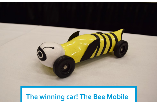
The winning car! The Bee Mobile Chapter B!