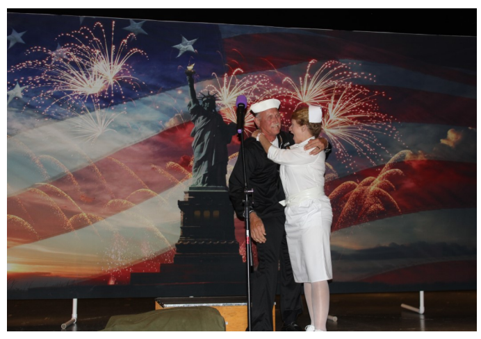
Having fun at the Talent Show/ Costume Party/Wear Your Uniform Contest!