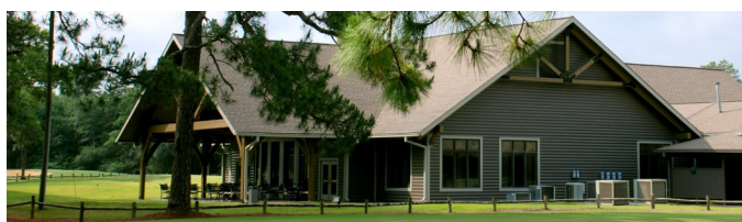
FAIRWAY GRILL RESTIURANT